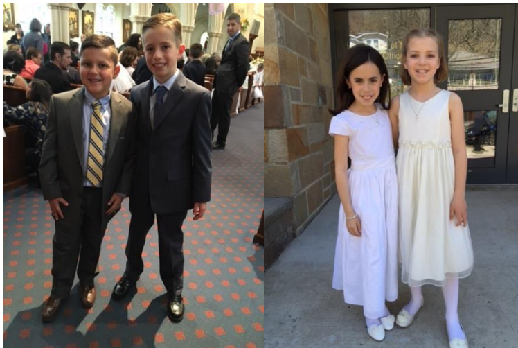
Last year on First Communion day